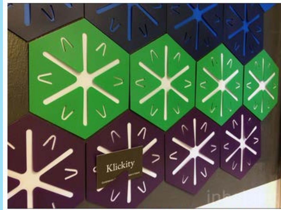
The hexagon shape of the sticky-backed Klip from Klickety allows you to create a modular bulletin board.