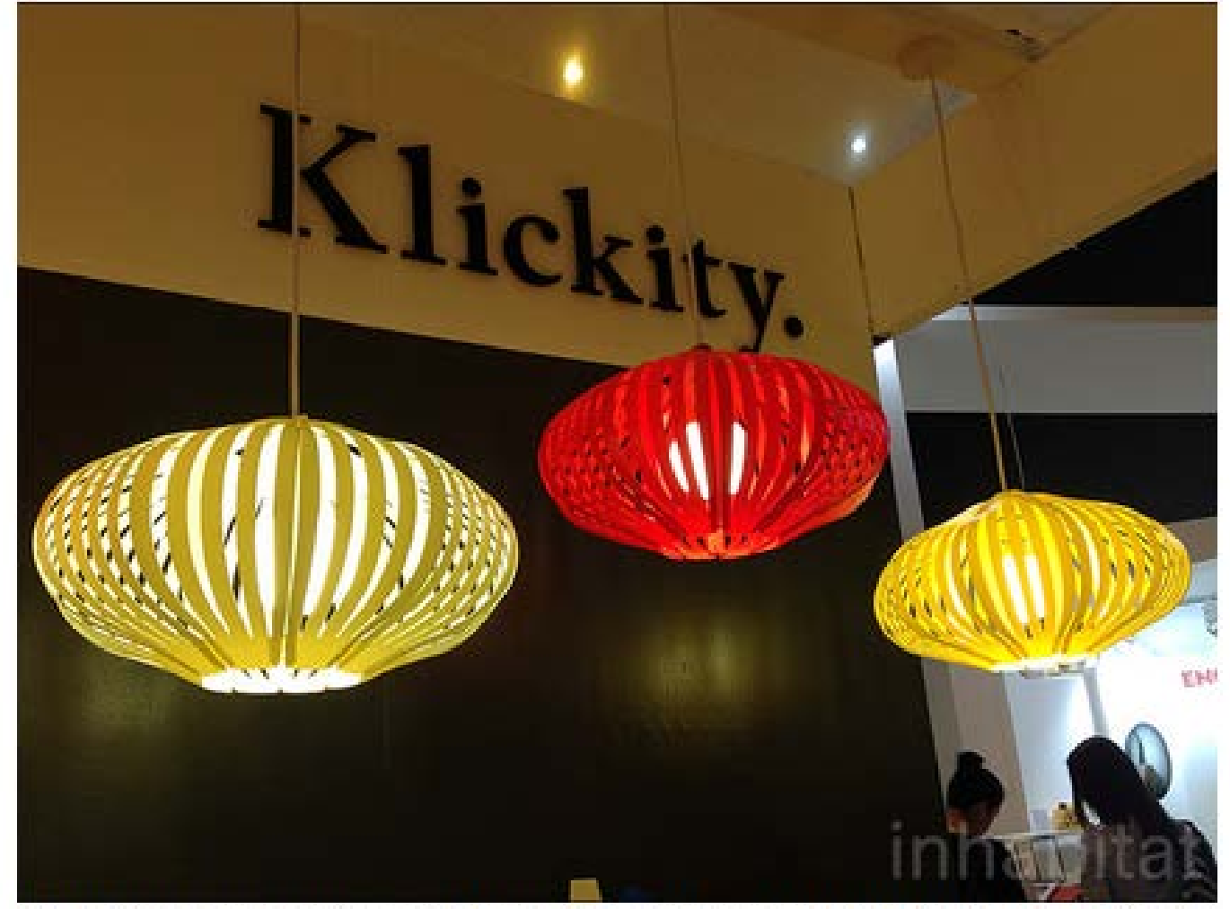
Klickity's accessories are designed and assembled in Ireland. The fig lamp, inspired by the traditional lantern shape, is made from 15 pieces of polypropylene, which come flat-packed. The lamp can be used with any standard pendant light fitting.