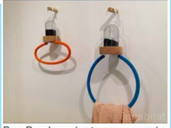
Bye Bye Laundry is a concept by

You don't need screws or glue to put the Kurk cork desk light together, even though it comes flat-packed. Because it all comes apart, each component of the light can be recycled or reused.