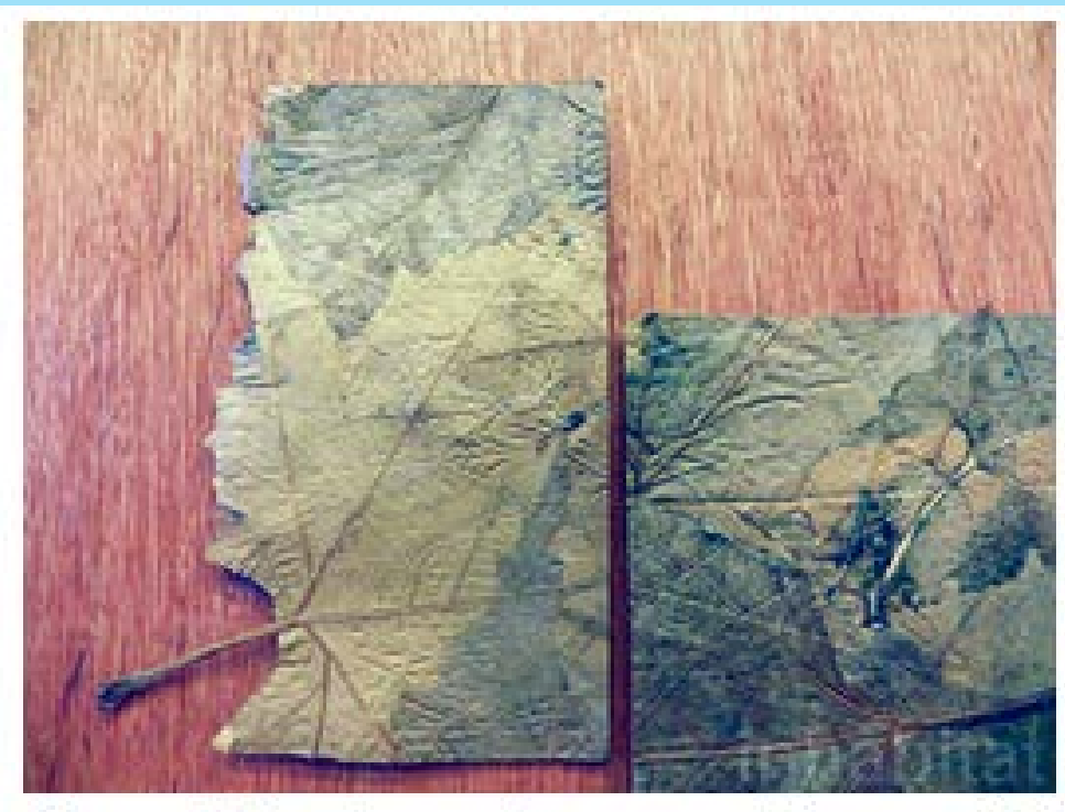
Meital Tzabari designed beautiful panels made from pressed fallen leaves.